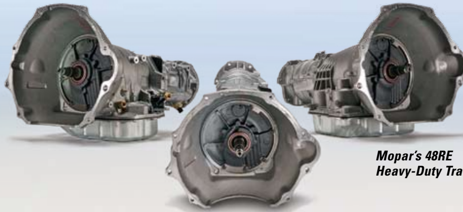
Mopar's 48RE Heavy-Duty Transmission